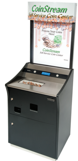
CoinStream CDS 926 Shown With Optional Sign

Contact us at 800-243-2624 ext. 336, cds@magner.com or your local Authorized Dealer. Visit www.selfservicecoin.com for our free Self-Service Coin Buyers Checklist .