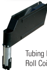
Tubing Drawer for Roll Coin Packaging