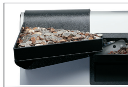
Optional Mounted Inspection Tray