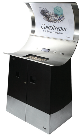
CoinStream CDS 709 Shown With Optional Sign

A Self Service Coin Center is more than a coin counter — it's a marketing tool that brings both existing and new customers in the door. It can also be a profit center for you or a community benefit center for your image. CoinStream is purpose-built to make a positive impression with its quiet and simple operation. Make a positive impact on your customers and tellers with CoinStream®.