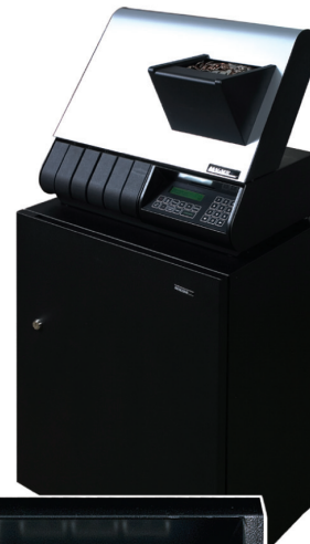
Security Bagging Stand