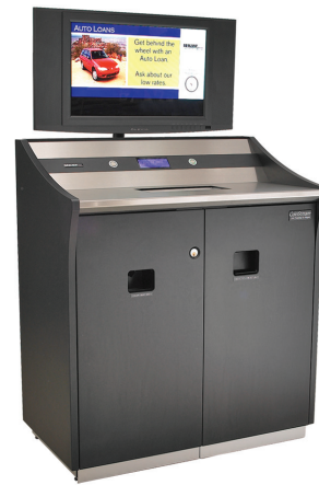
CoinStream CDS 909 Shown With Optional AdQue® Digital Flat Screen