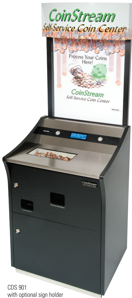
CDS 901 with optional sign holder

Allowing proper time to cross sell products and services