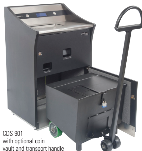
CDS 901 with optional coin vault and transport handle