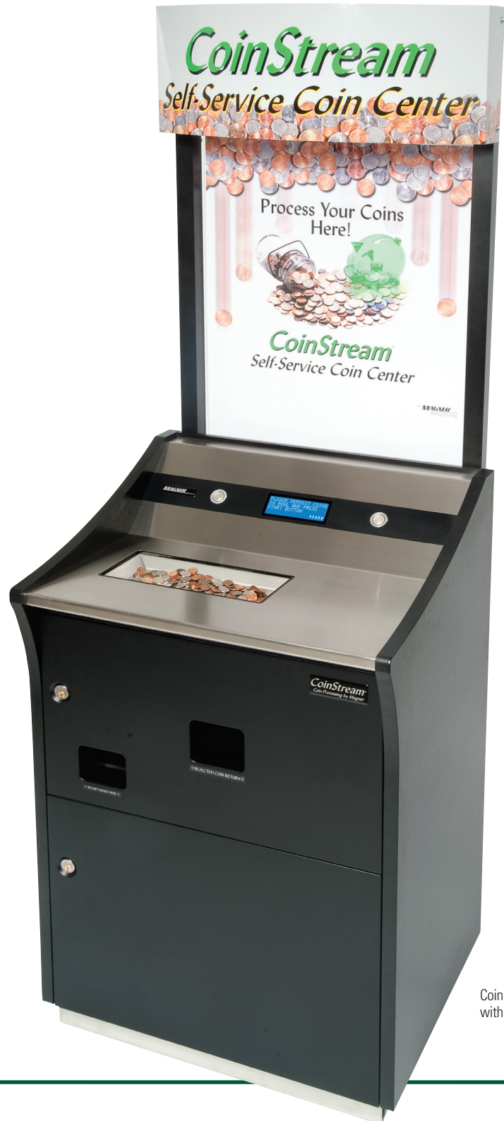
CoinStream ® CDS 901 with optional sign holder