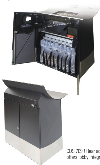
CDS 709R Rear access offers lobby integration