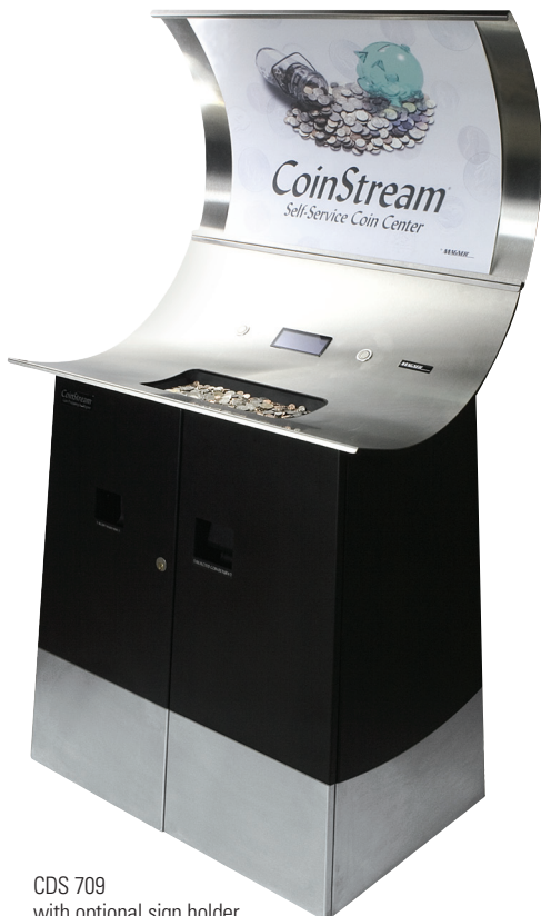
CDS 709 with optional sign holder

Direct access to all bags through secure doors; coins feed directly into bags at floor level, minimizing lifting which allows for easy bag removal